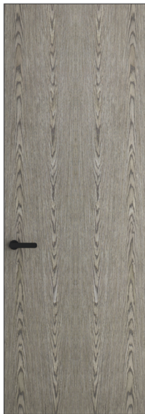
2 VT - V*