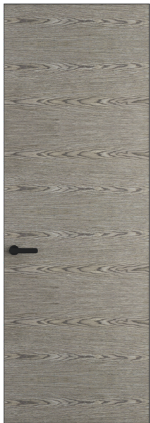
1 VT - H*